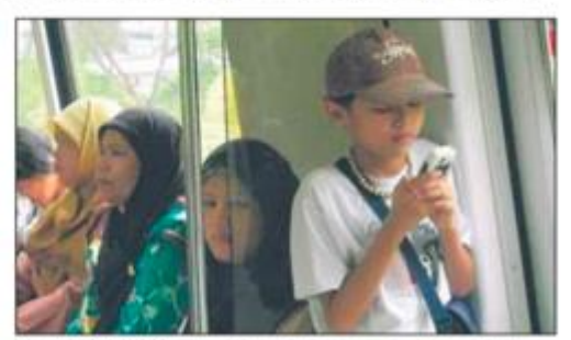
COMMUNICATING FEAR: Though cyber-bullying cases involving mobile phones have gone up, phone bullying can be hard to spot.

Alice's case reflects an emerging form of cyber-bullying through the use of mobile phones among youths